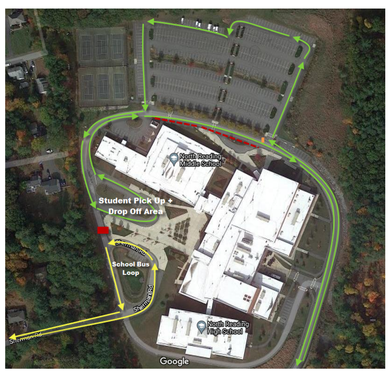
MAIN DROP OFF/PICK UP LOOP